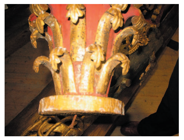
photo 12. Gilt cap of the iconostasis of the Church of the Transfiguration.

The funds were provided by the state budget according to «Plan of measures for maintenance and protection of Kizhi Pogost monuments (Kizhi Island, the Republic of Karelia) and development of infrastructure of the Kizhi Open-Air Museum of Architecture and Cultural History» (approved by the decree of the Government of RF № 1633-p as of 7.11.2008). It was supposed that 3 600 000 RUB must have