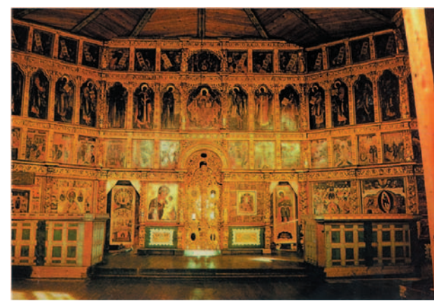
photo 3. General view of the Church iconostasis before the disassembly.

Pudozh sector of the museum was chosen for the location of the restoration center. The development of engineering infrastructure of this sector was going on in the reporting year with the purpose of adaptation of existing monuments of architecture (peasant houses) for restoration workshops. In this connection, the following measures have been taken: