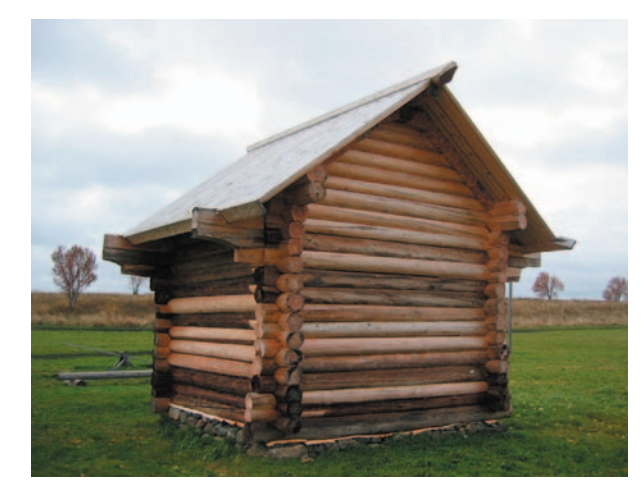
photo 6. The granary from the village of Peldozhi after restoration.

Logs in both of the buildings are noted for a good state of preservation on their inside surface (i.e. facing the interior of the monument), meanwhile their external surface is almost