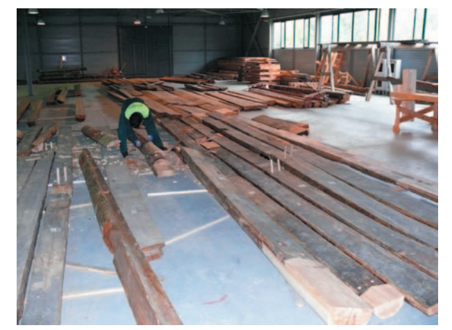
photo 7. General view of the assembly department with the Church floor components being spread and prepared for restoration.

The wood from the XVIIIth century or boards made of special timber stocked in 2004 were used for the restoration material. When selecting material, they took into consideration humidity, physical characteristics, and condition of the wood surface.