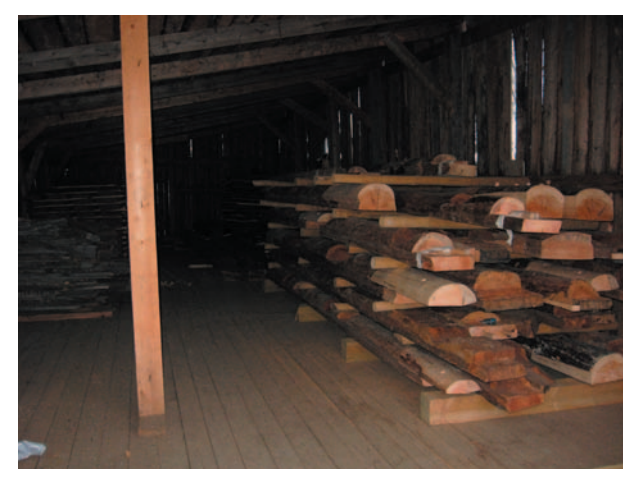
photo 8. The restored floor components are stockpiled before the restoration on Pogost.

3. Manufacturing, adjusting and fixation of insertion pieces for joining sawed elements and str-